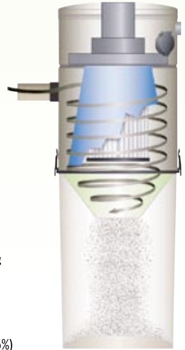
Using cyclonic separation, CFT removes 100% of vacuumed dirt from the living area.

Cyclonic Filtration Technology (CFT) is a dual filtration process that removes 100% of the vacuumed dirt from the living area. For primary filtration, CFT uses Cyclonic Separation, a process that removes 96-98% of the dirt from the air stream without the use of bags and filters.